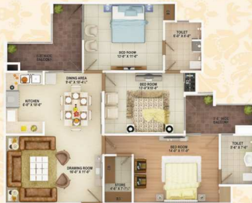
Imperial-2 & 5

3BHK +2 Toilet+Store Super Area: 1660 sq.ft.